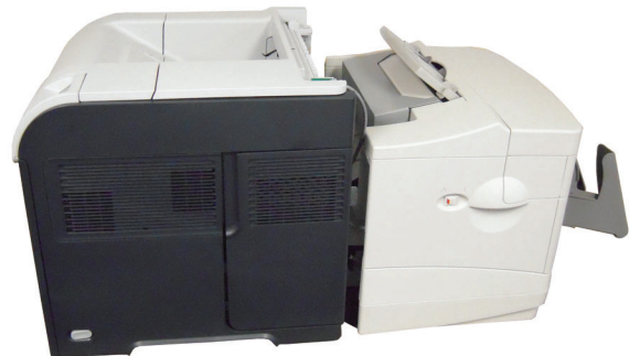
PTM4515 Accessory shown attached to an HP 4015 printer

Print to Mail TM is a registered trademark of PTM Document Systems